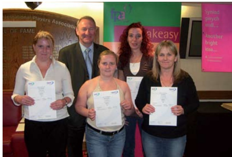
Parents and head teacher of Jenner Park Primary School, Barry, South Wales