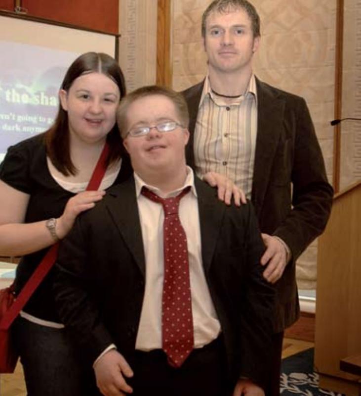
fpa and young people celebrate the launch of Out of the shadows at Stormont

Despite our hopes that the move would lead to a reduction in picketing, unfortunately people visiting our offices still encounter anti-choice activists outside the premises.