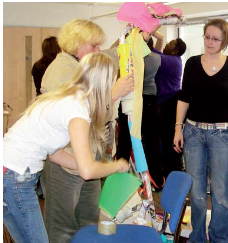
A team building exercise on the Core competencies training course

After a high profile launch at the House of Lords our flagship course for 2007 – Core competencies in sexual health for youth workers – achieved amazing results in its first year. It was a sell out package with 100 per cent take up of the university accreditation. It is the only course of its kind that equips participants with theoretical and practical approaches to working with young people. So far, attendees have come from a range of backgrounds including teenage pregnancy workers, youth service managers, drug and alcohol workers, school nurses and education professionals. We have established five new accredited courses in partnership with the University of Staffordshire.