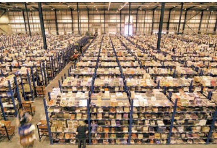
The warehouse at Bertrams

fpa's sales division has now moved to the UK's leading book wholesaler Bertrams. This means all your sexual health resources including booklets, DVDs and books will arrive through a speedy delivery network. But do be assured that because we value our customer relationships, whenever you phone with an order you will still always speak to a dedicated fpa staff member of our sales team.