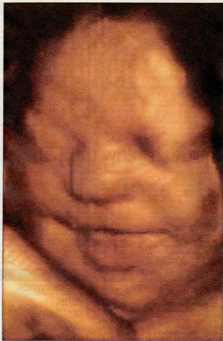
Happiness: an unborn baby smiles in the womb in a picture taken using new scanning techniques

The fetal features are very clear, and as it is in 4D (i.e. including real time movement) you can see the movements that they make. The images were construed as evidence of babies feeling emotion – ‘proof that babies smile in the womb’ (Evening Standard, 12 th September 2003). Scientifically, this is an over-interpretation of the images, which adds an intellectual angle, equating the feature of a smile with feelings of happiness, in that instance. Medical experts know that the brain of the fetus is not able to cortically function at the stage of the 4D images so they cannot tell us about the fetus’ state of mind.